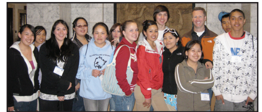
FTA students and Advisors visit the State Legislature at the 2008 FTA Student Gathering.

The next Gathering will be held April 22-24, 2009 in Fairbanks. We hope to see you there!