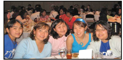
Lower Yukon School District FTA students at the 2008 FEA National Conference.

Congratulations to all our FTA club members! Your energy and commitment is truly making a difference!