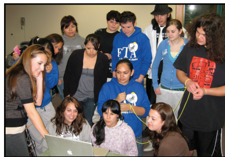
FTA staff and PITAAS college freshmen at the 2008 PITAAS Summer Institute.

The University of Alaska Southeast (UAS) just received word that the Preparing Indigenous Teachers and Administrators for Alaska's Schools (PITAAS) program was refunded by the U.S. Department of Education, Alaska Native Education Program.